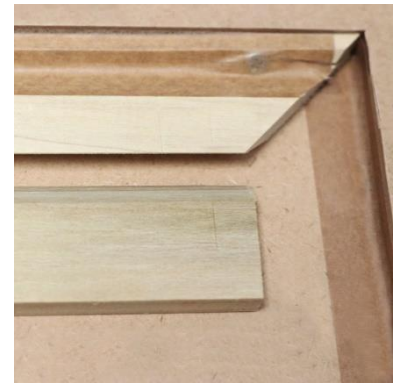
Split Battens / French Cleets

Below are examples of fixings that should be removed or reversed as they can damage other work.