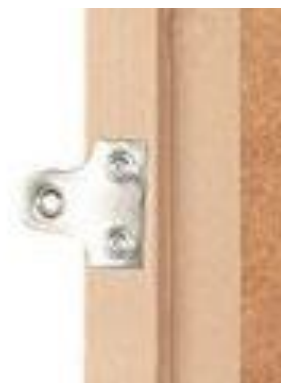
Mirror Plates (unreversed)

Below are examples of fixings that should be removed or reversed as they can damage other work.